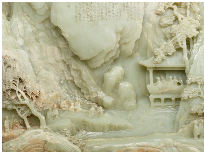
China, Jade Mountain Illustrating the Gathering of Scholars at the Lanting Pavillion (detail), 92.103.13 Gallery 210

Many of these questions are designed to prompt close looking and critical thinking. Read each artwork's label to find answers to fact-based questions. Artwork not on view? Don't worry: There are plenty of others to visit!