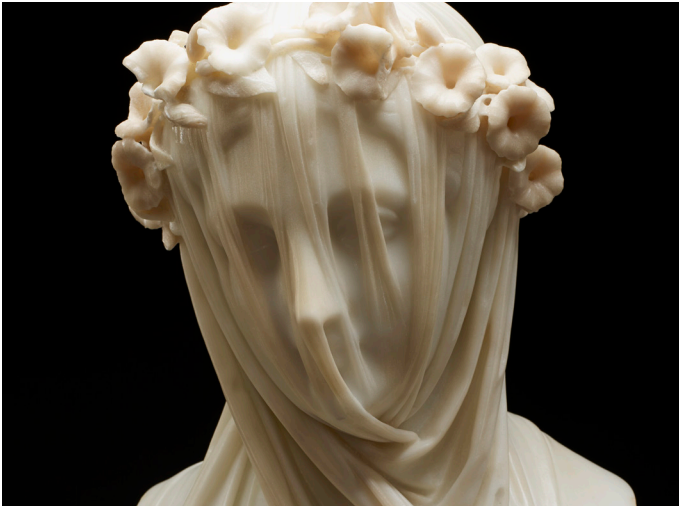
Raffaello Monti, Veiled Lady (detail), 70.60 Gallery 357

At first glance, what material does this bust appear to be made of? What do you see that makes you say that? What type of emotion do you think this woman is expressing? Why?