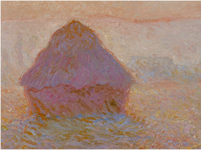
Claude Monet, Grainstack, Sun in the Mist (detail), 93.20 Gallery 355

Why do you suppose this car is in the galleries? What about it would you consider artistic? What car do you think you'll see in a museum 75 years from now?