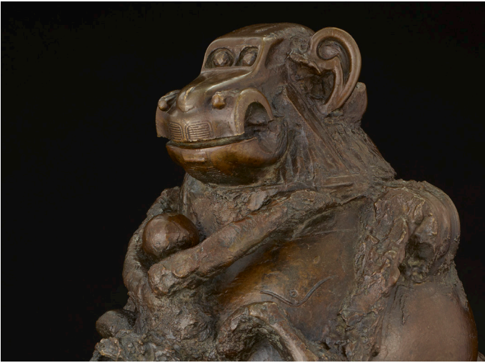
Pablo Picasso, Baboon and Young (detail), 55.45 Gallery 376

What everyday objects do you see in this sculpture? If you were to make a sculpture with objects in your home or school, what would you use? Why do you suppose Picasso chose these objects? What does the sculpture tell you about him?