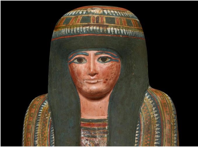
Egypt, Cartonnage of Lady Tashat (detail), 16.417 Gallery 250

What do this man's physical characteristics tell you about him? Look at both his head and body. What artistic detail impresses you the most? Why? What do you wonder about The Doryphoros ?