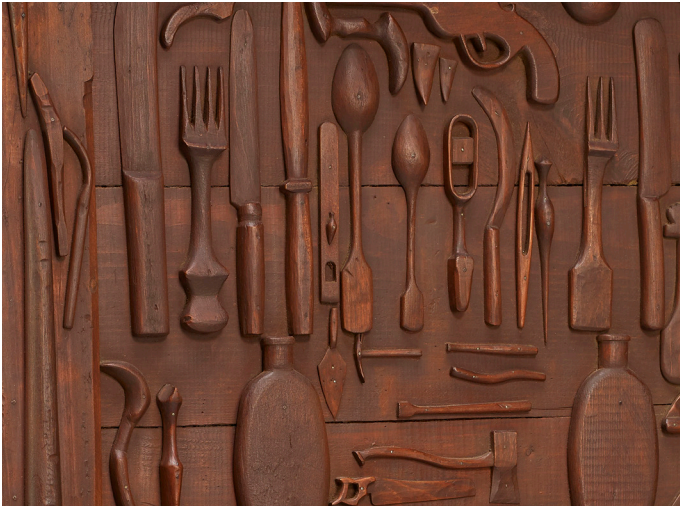
William Howard, Writing desk (detail), 2012.11 Gallery 304

At first glance, what material does this bust appear to be made of? What do you see that makes you say that? What type of emotion do you think this woman is expressing? Why?