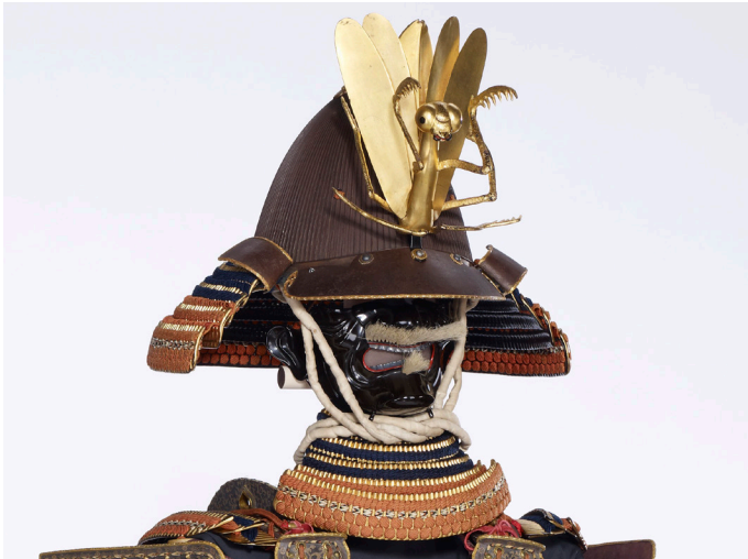
Japan, Suit of Armor from the Kii Tokugawa Family (detail), 2009.60a-s Gallery 219

Look closely. There's a lot to see. What first catches your attention? Why? What appears to be going on? What do you see that makes you think that? Mandalas are usually made with colored sand. What material did the monks use to make this one?