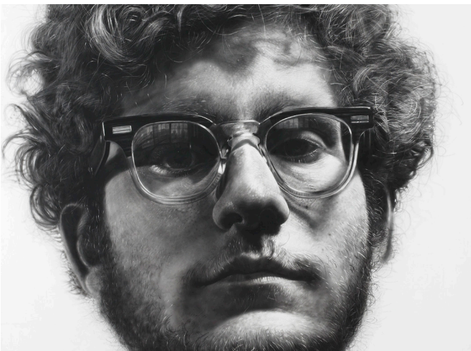
Chuck Close, Frank (detail), 69.137 Gallery 373

Look around the gallery. Which do you prefer: painted objects or beaded objects? Why?