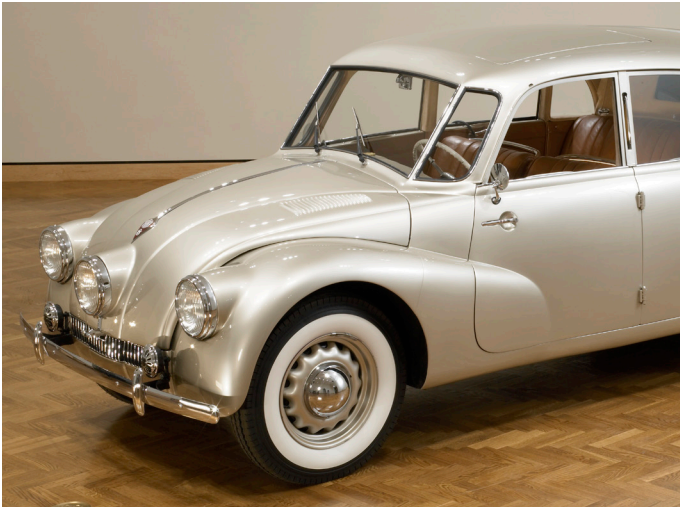
Hans Ledwinka, Tatra T87 four-door sedan (detail), 2005.138 Gallery 379

What everyday objects do you see in this sculpture? If you were to make a sculpture with objects in your home or school, what would you use? Why do you suppose Picasso chose these objects? What does the sculpture tell you about him?