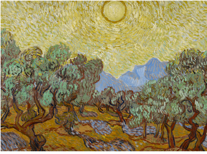
Vincent van Gogh, Olive Trees (detail), 51.7 Gallery 355

Describe the range of colors in this painting. What words would you use to describe the mood? What season do you think this shows? What makes you think so? What do you wonder about?