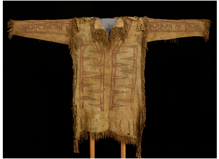
Innu (Naskapi), Hunting Coat , 2012.27 Gallery 261

Would you like to have your portrait made as a sculpture or as a painting? Why?