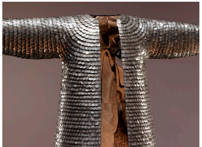
Do-Ho Suh, Some/One (detail), 2012.77a-d Gallery 373

How does the size of this artwork influence how you feel about it?