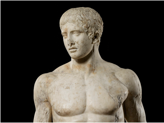
Roman, The Doryphoros (detail), 86.6 Gallery 230

What's your first reaction to this suit of armor? Look closely at its craftsmanship: notice how hundreds of lacquered metal and leather plates are laced together with cords. Why might it have been made in this way? What aspects communicate the power of its wearer?