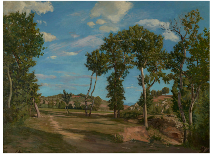
Jean-Frédéric Bazille, Landscape by the Lez River (detail), 69.23 Gallery 355

What about this painting appears most real?