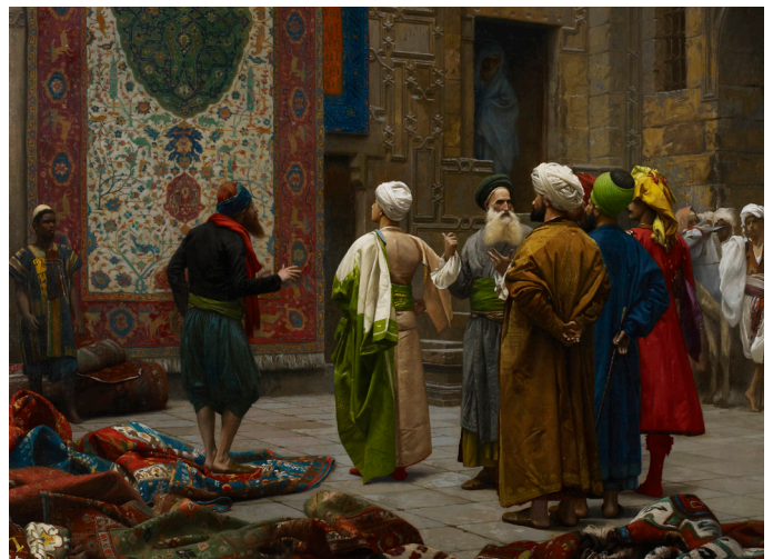
Jean-Léon Gérôme, The Carpet Merchant (detail), 70.40 Gallery 357

Start your exploration of Impressionism with an example of academic painting, like The Carpet Merchant . For discussion purposes, this tour also includes examples of American Impressionist and Post-Impressionist painting.