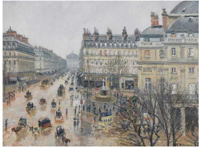
Camille Pissarro, Place du Théâtre Français, Paris: Rain (detail), 18.19 Gallery 351

What do you think is going on here? What do you see that makes you say that? What time of day do you think it is? How do you know? Do you think the painting is finished or unfinished? Why? What impressions do you see?