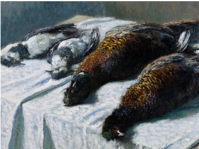
Claude Monet, Still Life with Pheasants and Plovers (detail), 84.140 Gallery 355

Describe the brushstrokes in the sky. How do these differ from the brushstrokes in the leaves?