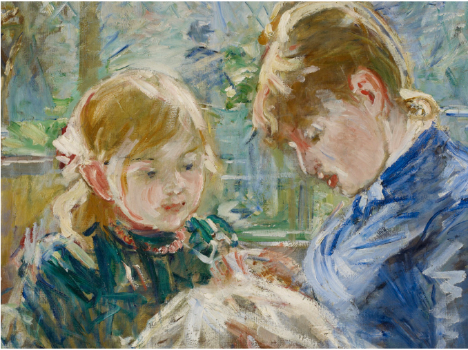
Berthe Morisot, The Artist's Daughter, Julie, with her Nanny (detail), 96.40 Gallery 351

What do you think is going on here? What do you see that makes you say that? What time of day do you think it is? How do you know? Do you think the painting is finished or unfinished? Why? What impressions do you see?