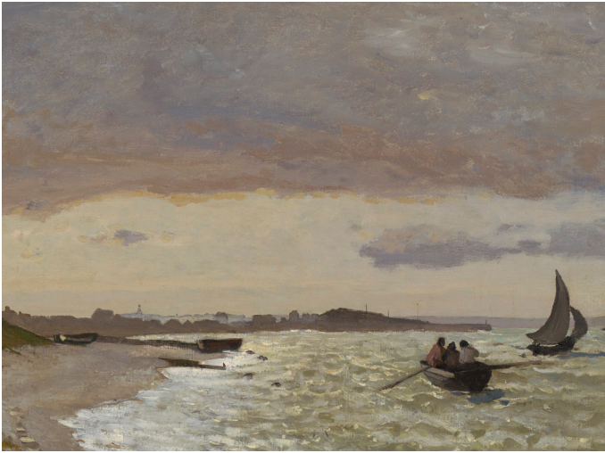
Claude Monet, The Seashore at Sainte-Adresse (detail), 53.13 Gallery 355