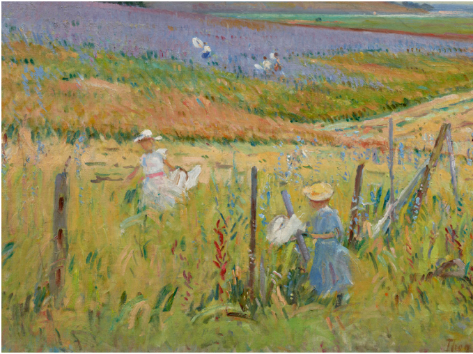
Theodore Wendel, The Butterfly Catchers (detail), 2001.43 Gallery 322