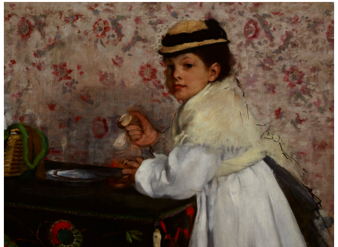
Edgar Degas, Portrait of Mlle. Hortense Valpinçon (detail), 48.1 Gallery 351

Describe the range of colors in this young woman's skin and hair. Where do you see Renoir's brushstrokes? What do you think she's thinking? What about her face tells you that? What do you think is going on around her? Why?