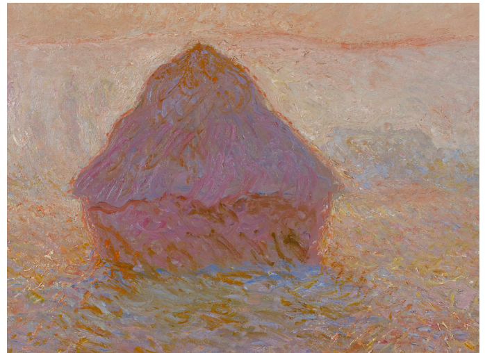
Claude Monet, Grainstack, Sun in the Mist (detail), 93.20 Gallery 355

What do you see that makes you think that?