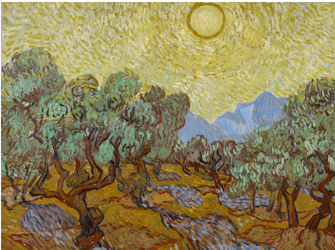
Vincent van Gogh, Olive Trees (detail), 51.7 Gallery 355

Would you consider this ordinary or extraordinary? Why?