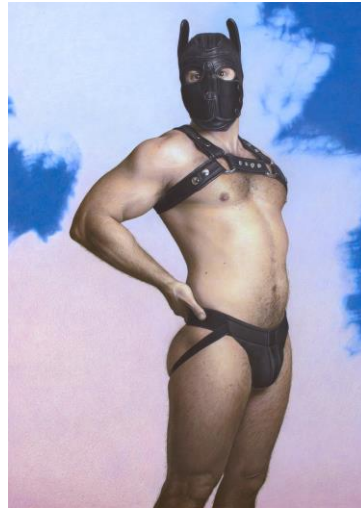
Joe Sinness, Untitled (pose 2) , 2017, colored pencil on paper. Courtesy the artist © Joe Sinness. (Left)