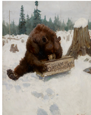
A "Bear" Chance