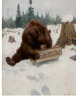
A "Bear" Chance