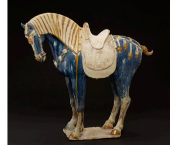
China 8th century, earthenware, glaze