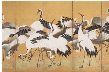
Ishida Yūtei 18th century, ink, color, and gold on paper