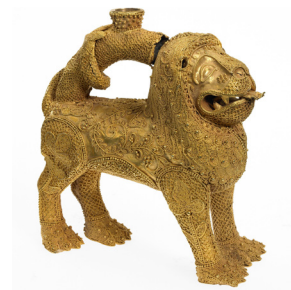
Hispano-Moorish Europe 11th–12th century, gold