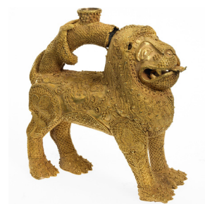
Hispano-Moorish Europe 11th–12th century, gold