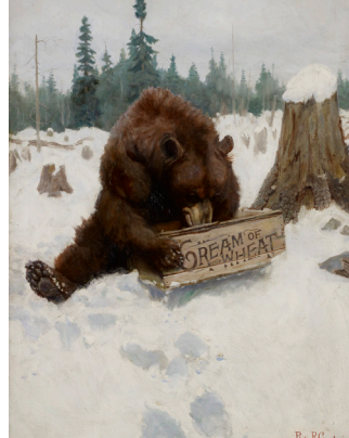
A "Bear" Chance