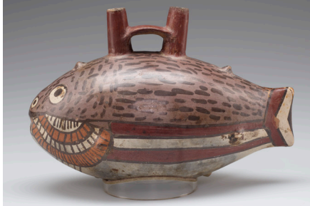
Nazca, Peru 100 BCE–600 CE, clay, pigments