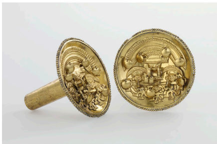
Chimú, Peru, 1150-1450, gold alloy