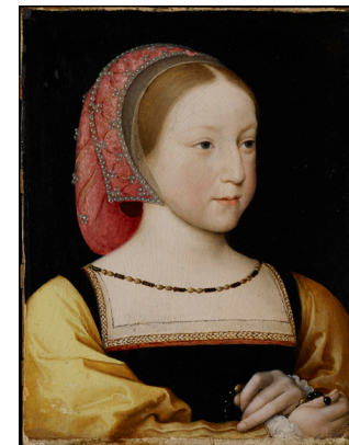
Jean Clouet the Younger, 1522, oil on cradled panel