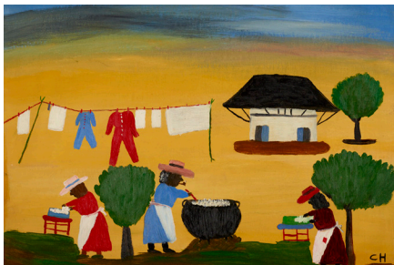
Clementine Hunter, 1950s, oil on board