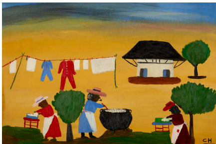
Clementine Hunter, 1950s, oil on board