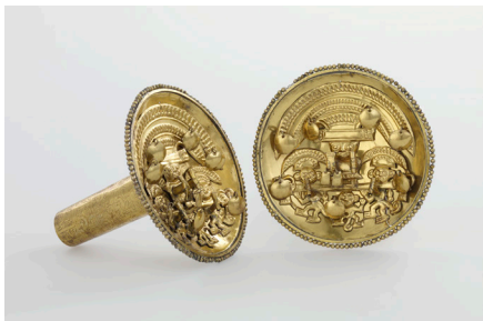
Chimú, Peru, 1150-1450, gold alloy