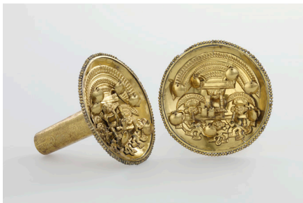
Chimú, Peru, 1150-1450, gold alloy