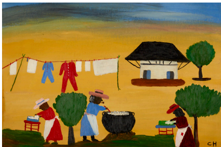
Clementine Hunter, 1950s, oil on board