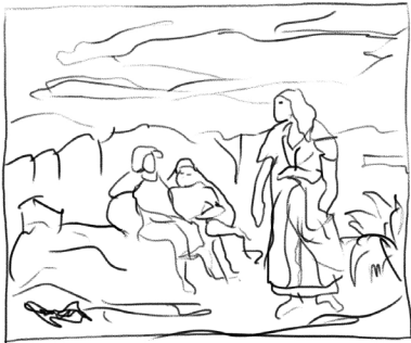
View of Tangier by Eugène Delacroix