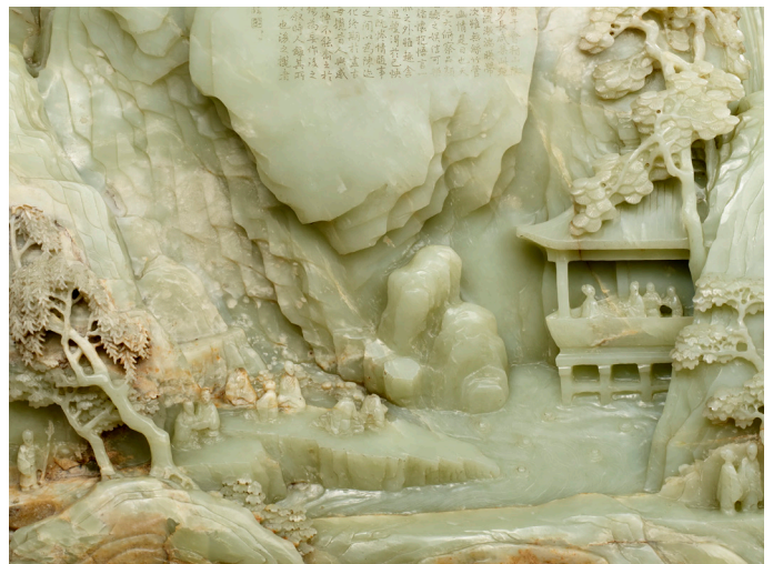
GALLERY 210 China, Jade Mountain Illustrating the Gathering of Scholars at the Lanting Pavillion (detail), 92.103.13

Many of these questions are designed to prompt close looking and critical thinking. Read each artwork’s label to find answers to fact-based questions. Artwork not on view? Don’t worry: There are plenty of others to visit!