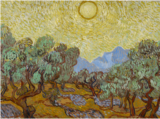
GALLERY 355 Vincent van Gogh, Olive Trees (detail), 51.7