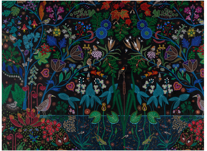
GALLERY 259 Christi Belcourt, Canada, étis, born 1966, It's a Delicate Balance (detail), 2021, Acrylic on canvas, 2021.30, © Christi Belcourt