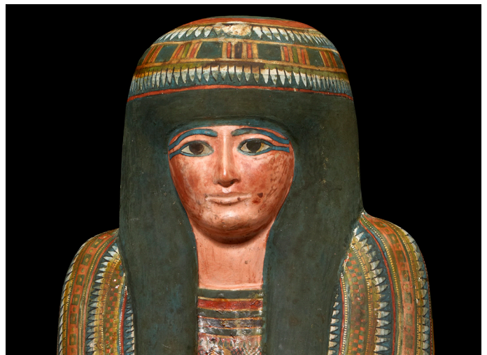
GALLERY 250 Egypt, Cartonnage of Lady Tashat (detail), 16.417