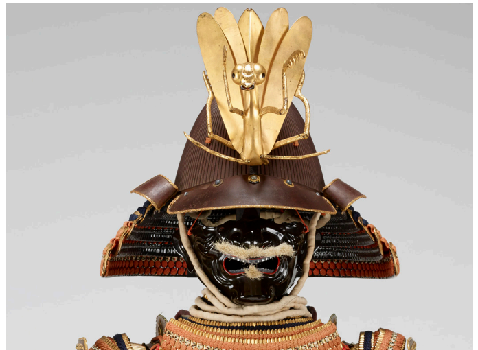
GALLERY 219 Japan, Suit of Armor from the Kii Tokugawa Family (detail), 2009.60a-s